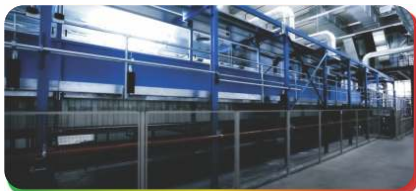
Hennecke German Technology

We thrive on developing leading-edge solutions in technology, processes and products. We constantly produce new customized foam qualities for specific use cases in variety of industries. Our relentless focus on R&D ensures that we are ahead of the industry in all respects.